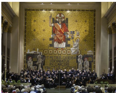
The KSO performs at Vespers at St. Peter in Chains in 2013.